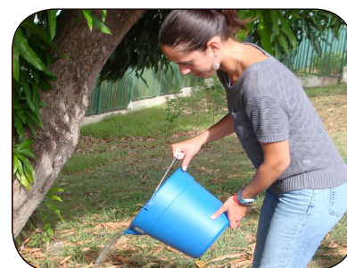
Drain & dump any standing water.