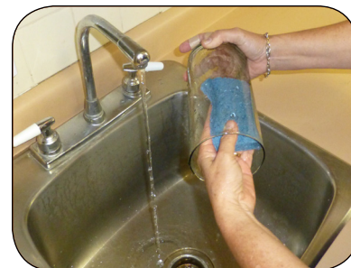
Weekly, scrub vases & containers to remove mosquito eggs.