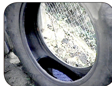
Recycle used tires or keep them protected from rain.