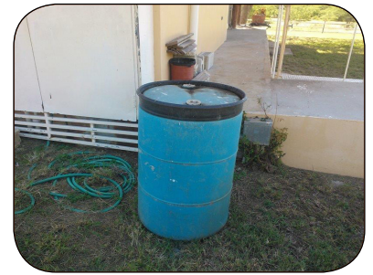
Keep rain barrels covered tightly.