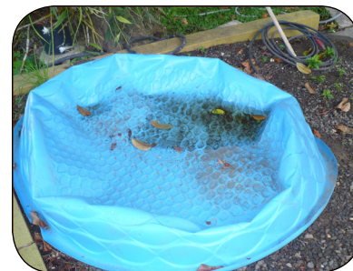
Drain water from pools when not in use.