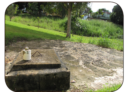
Keep septic tanks sealed.