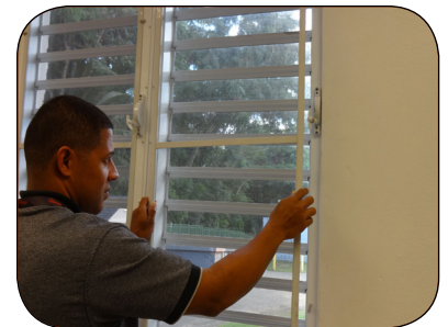
Install or repair window & door screens.