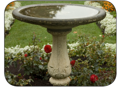
Weekly, empty standing water from fountains and bird baths.