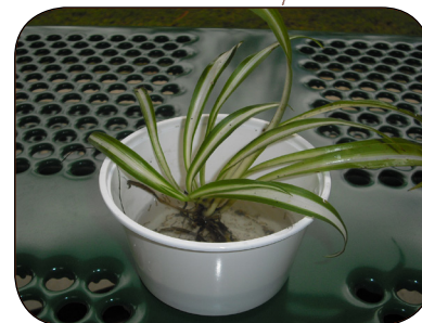
Put plants in soil, not in water.