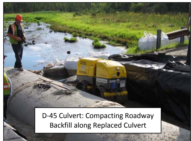
D-45 Culvert: Compacting Roadway Backfill along Replaced Culvert