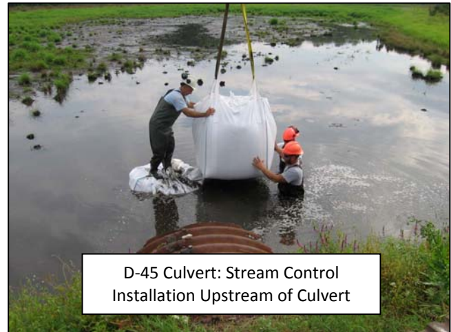
D-45 Culvert: Stream Control Installation Upstream of Culvert