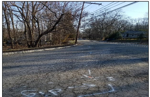
CR 605/Green Apple Rd.: View of Project Site Looking North