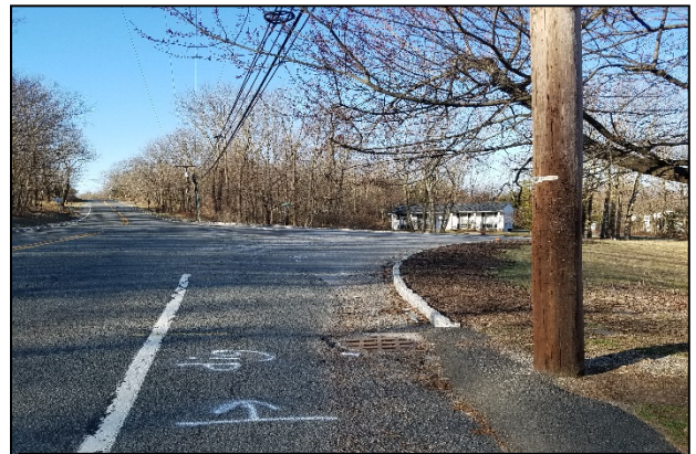
CR 605/Green Apple Rd.: View of Project Site Looking South

For more information about this project please feel free to contact Josh Roe, Engineer Trainee, of the Sussex County Division of Engineering at 973-579-0430 or dpw@sussex.nj.us