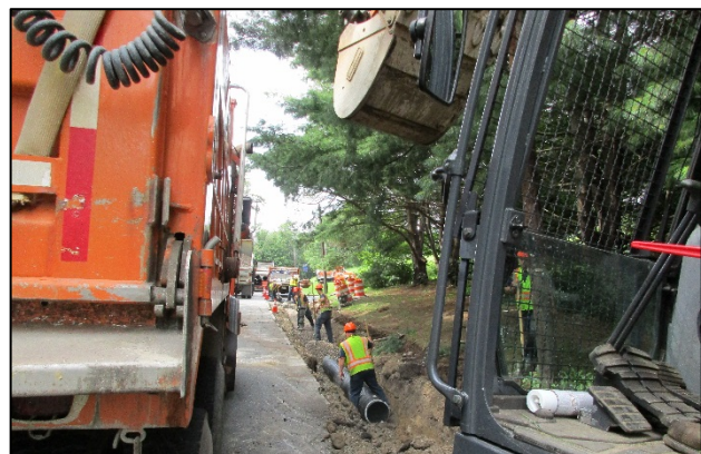
Typical Drainage Pipe Installation