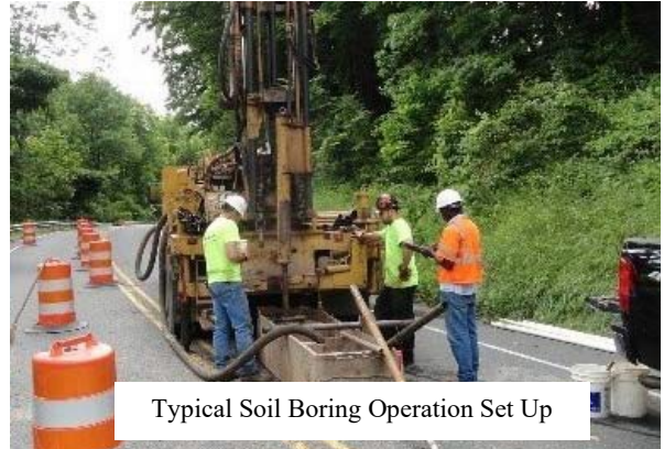
Typical Soil Boring Operation Set Up

Therefore, a truck mounted drilling rig (see photo) will be mobilized at this location to conduct a geotechnical investigation.