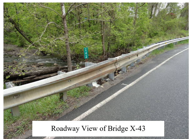
Roadway View of Bridge X-43