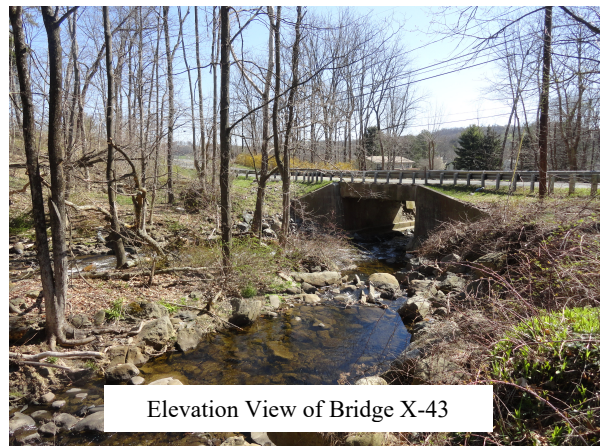
Elevation View of Bridge X-43

Unionville Road, between SR 23 and Rose Morrow Road will be under construction for the geotechnical engineering investigation. PVMS's will be installed in advance of the project, at both bridge approaches, to alert motorists of delays and advise to plan alternate route. Access to driveways and municipal roads will be maintained throughout the duration of the operation.