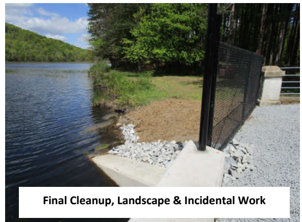
Final Cleanup, Landscape & Incidental Work