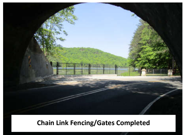
Chain Link Fencing/Gates Completed