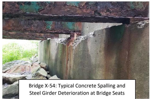
Bridge X-54: Typical Concrete Spalling and Steel Girder Deterioration at Bridge Seats