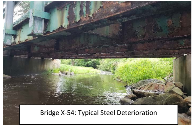
Bridge X-54: Typical Steel Deterioration