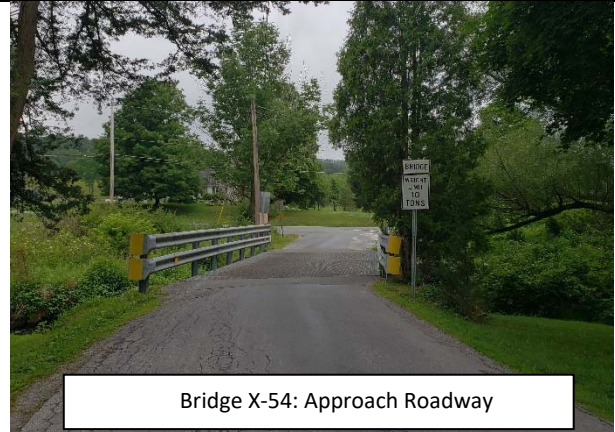
Bridge X-54: Approach Roadway