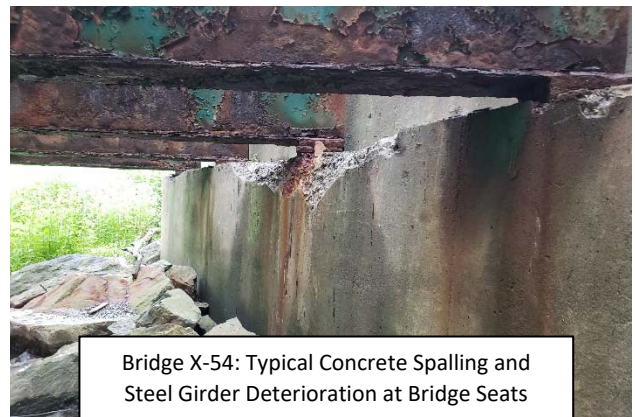
Bridge X-54: Typical Concrete Spalling and Steel Girder Deterioration at Bridge Seats