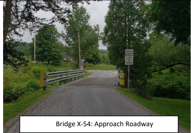
Bridge X-54: Approach Roadway