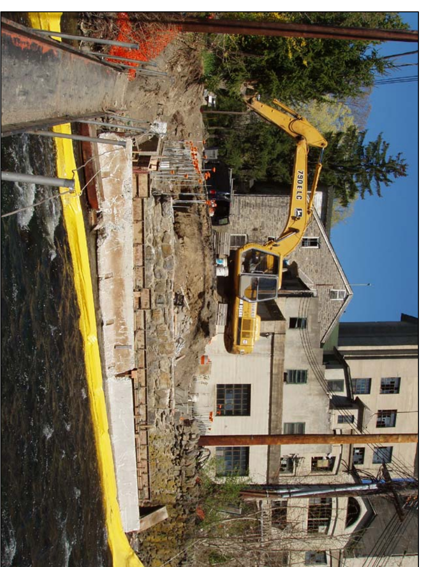
FOUNDATION EXCAVATION FOR CONSTRUCTION OF NEW CONCRETE WINGWALLS