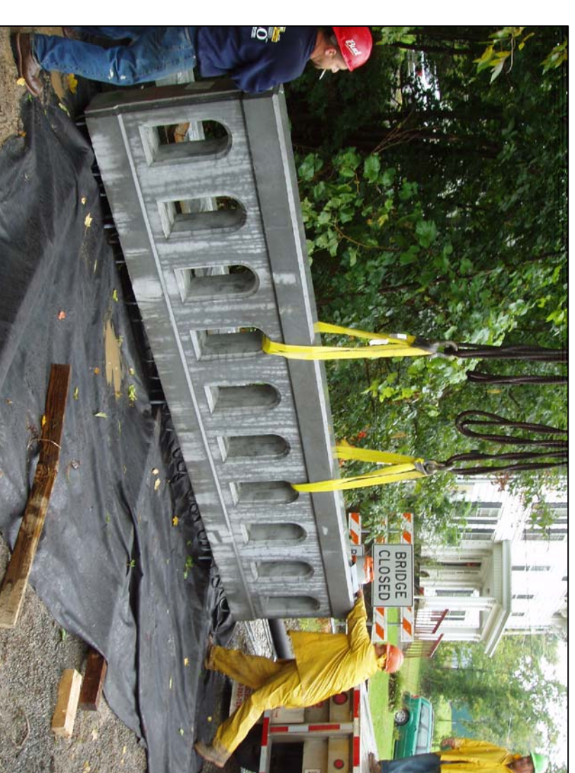
NEW PRECAST CONCRETE OPEN BRIDGE RAILINGS BEING DELIVERED