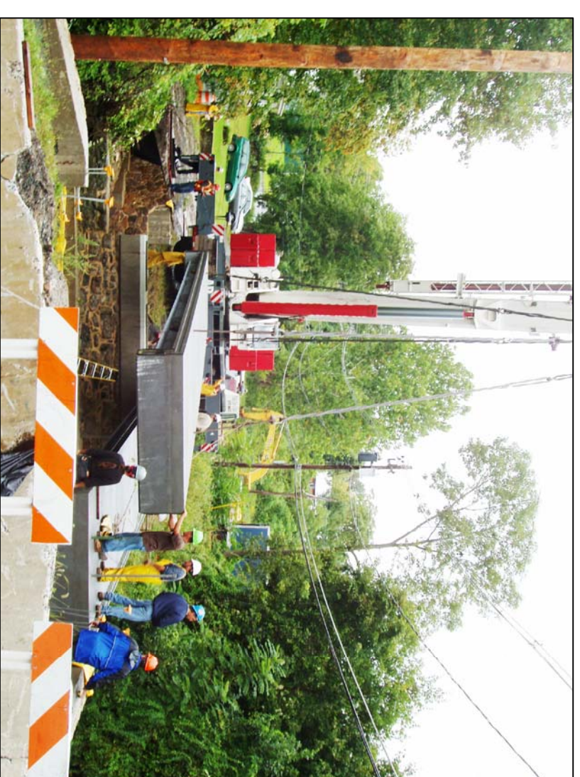
PREFAB BRIDGE UNITS BEING ERECTED ON RESTORED ABUTMENTS