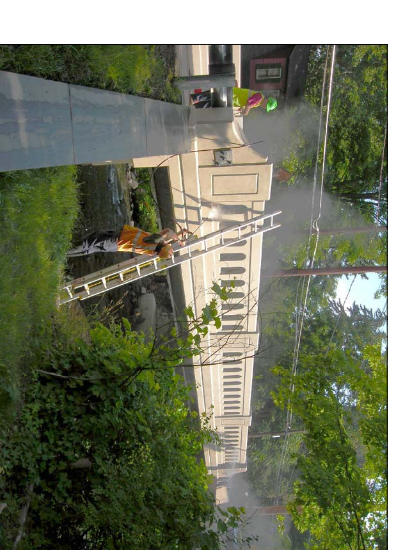
NEW CONCRETE BRIDGE RAILING BEING CLEANED & STAINED TO MATCH ADJACENT HISTORIC MILL