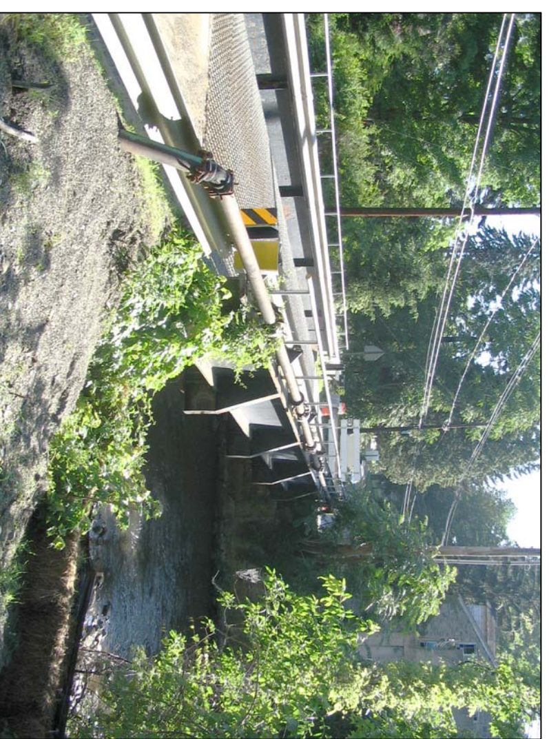
OLD BRIDGE H9-01 STEEL THRU-GIRDERS WITH OPEN GRID DECK BUILT IN 1965