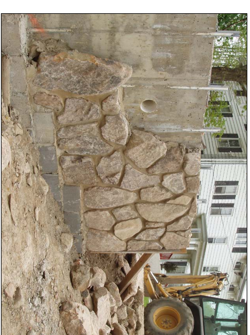
NEW CONCRETE WINGWALL WITH STONE VENEER UNDER CONSTRUCTION