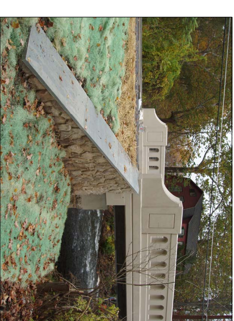
NEW CONCRETE WINGWALL WITH STONE VENEER TO MATCH OLD ABUTMENT MASONRY