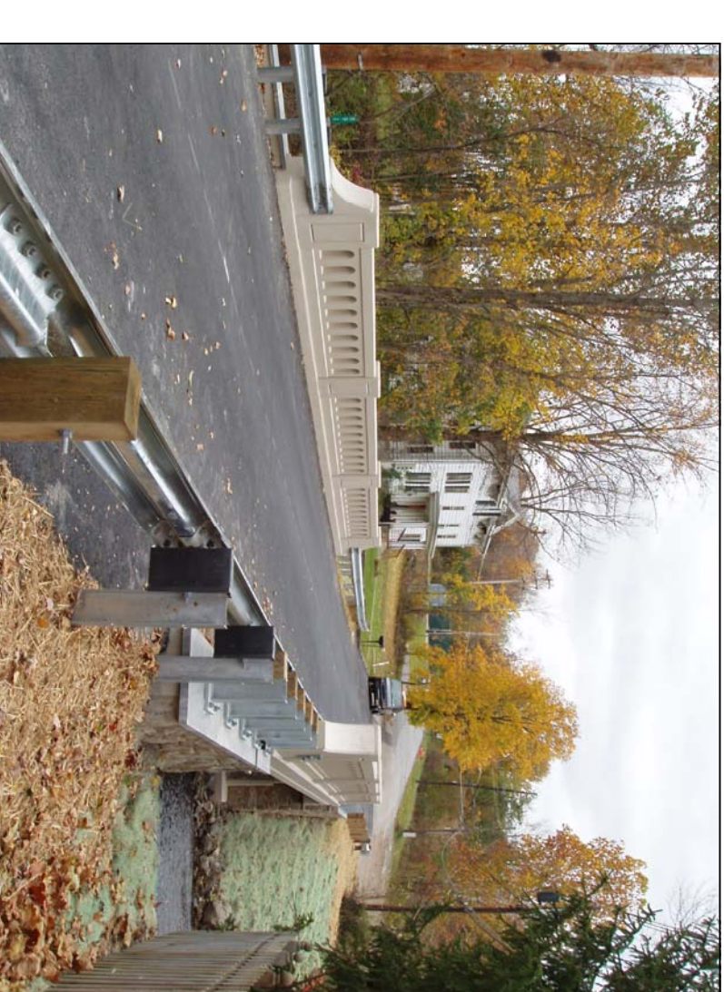
COMPLETED PROJECT RE-OPENED TO TRAFFIC OCTOBER 2006