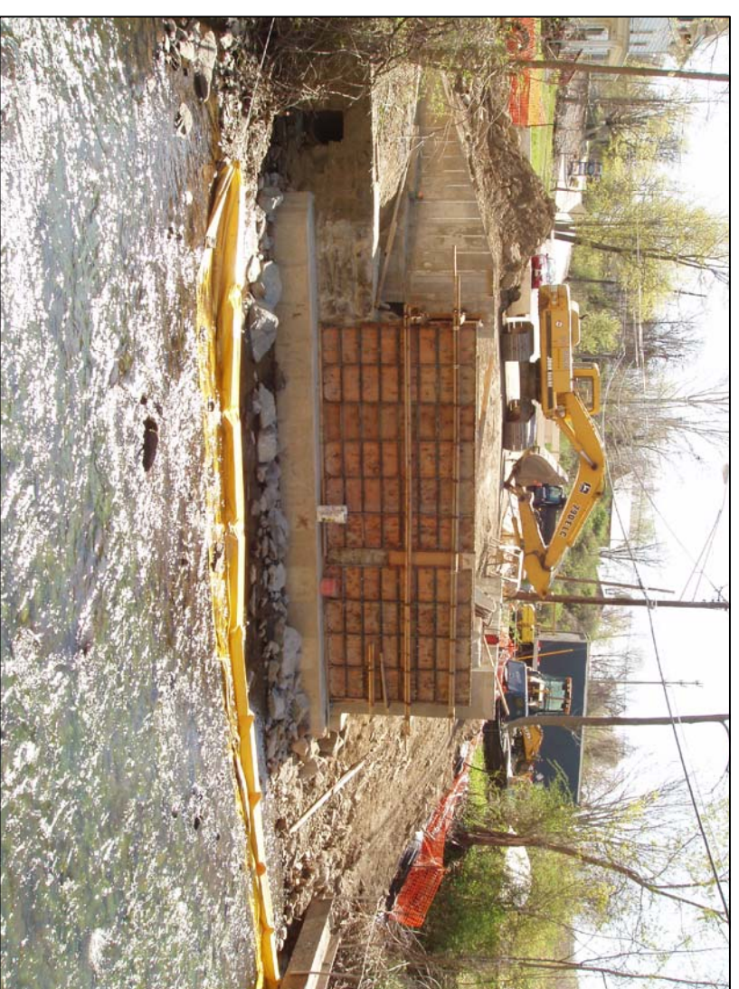
CONSTRUCTION OF NEW CONCRETE WINGWALL AND ABUTMENT BRIDGE SEAT