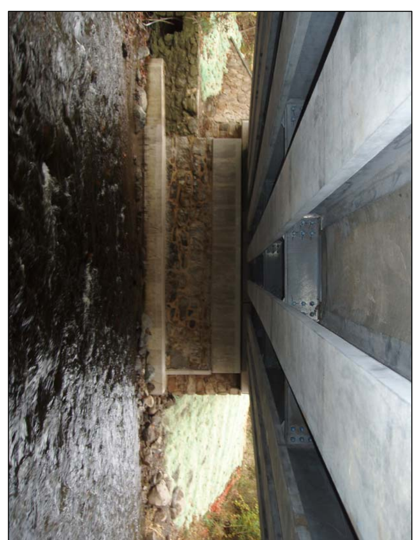
UNDERSIDE OF PREFAB BRIDGE ON NEW CONCRETE SEAT ABOVE RESTORED MASONRY ABUTMENT