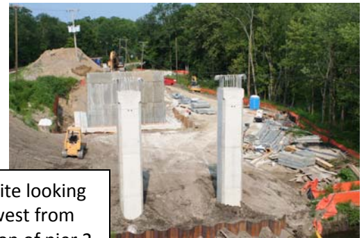
Site looking west from top of pier 2