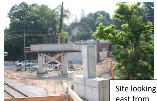
Site looking east from top of pier 2

For more information about this project please feel free to contact Charles Porter, P.E., at the Sussex County Division of Engineering at 973-579-0430 or dpw@sussex.nj.us