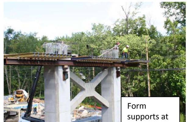
Form supports at Pier 1