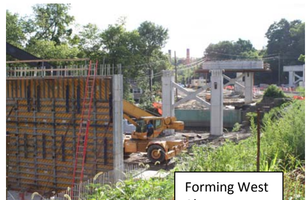
Forming West Abutment wall