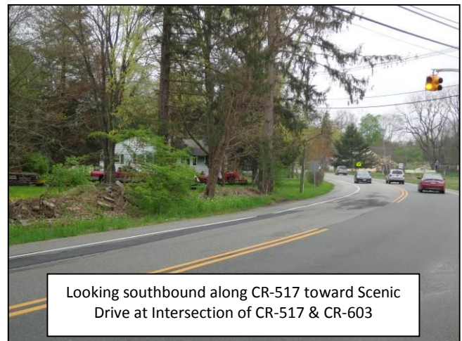
Looking southbound along CR-517 toward Scenic Drive at Intersection of CR-517 & CR-603