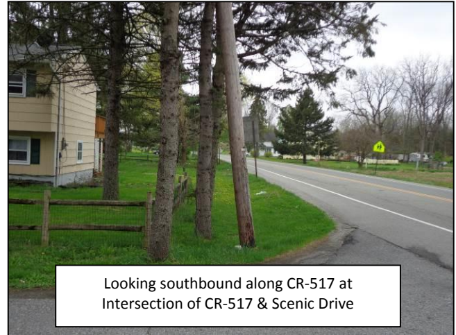
Looking southbound along CR-517 at Intersection of CR-517 & Scenic Drive