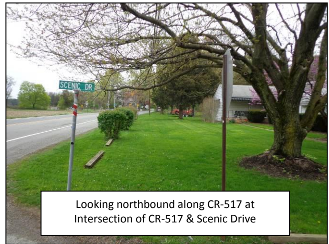
Looking northbound along CR-517 at Intersection of CR-517 & Scenic Drive