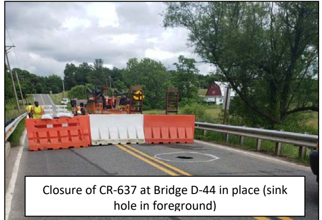
Closure of CR-637 at Bridge D-44 in place (sink hole in foreground)