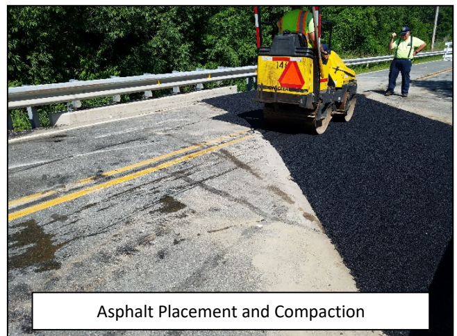
Asphalt Placement and Compaction