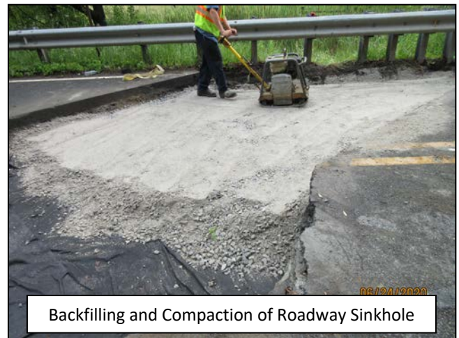
Backfilling and Compaction of Roadway Sinkhole