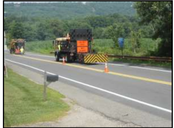
Typical Striping Operation