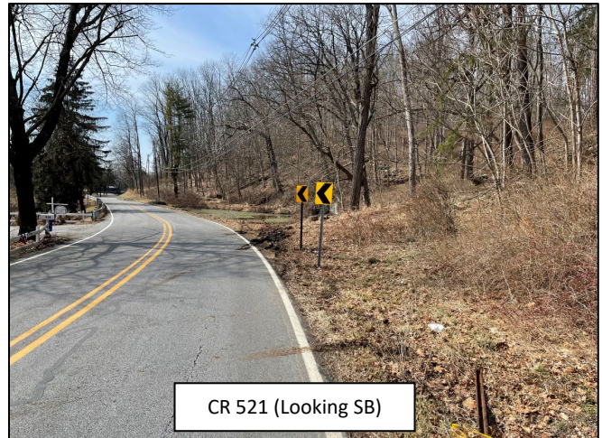
CR 521 (Looking SB)