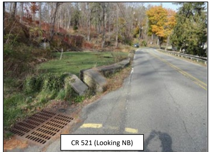
CR 521 (Looking NB)