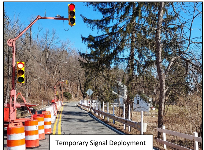
Temporary Signal Deployment