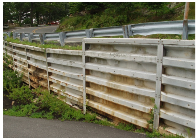
Picture of CR 607 Retaining Wall