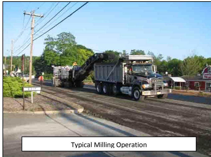
Typical Milling Operation