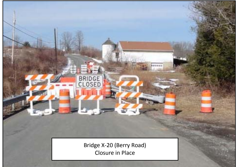
Bridge X-20 (Berry Road) Closure in Place

Damage sustained during the storms of 2011 and subsequent storm events (Hurricane Sandy and other significant flows) have resulted in continued deterioration of the masonry substructure and roadway embankments at Bridge X-20. In the interest of public safety Bridge X-20 has been closed pending construction of a full bridge replacement.