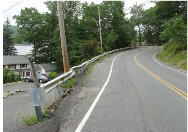
Picture of CR 607, Maxim Drive, above Retaining Wall – Area of Utility Work