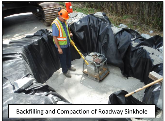
Backfilling and Compaction of Roadway Sinkhole