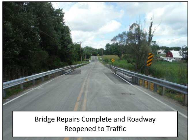
Bridge Repairs Complete and Roadway Reopened to Traffic