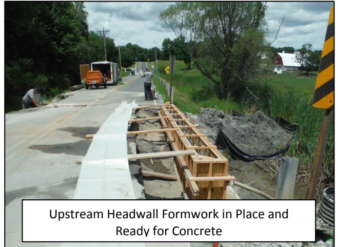
Upstream Headwall Formwork in Place and Ready for Concrete