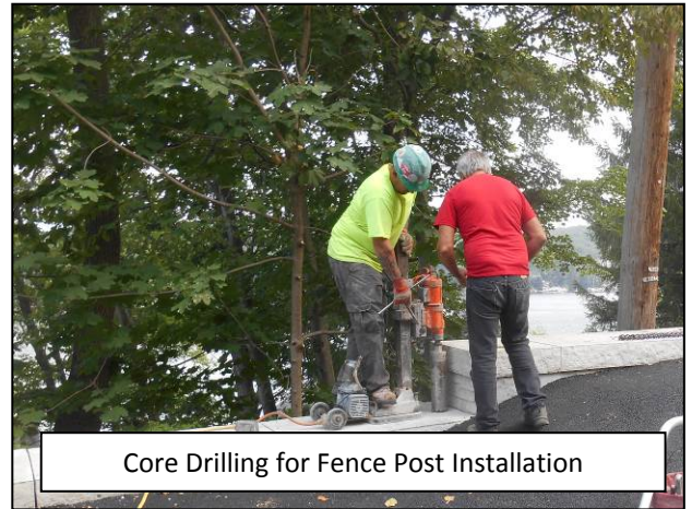
Core Drilling for Fence Post Installation