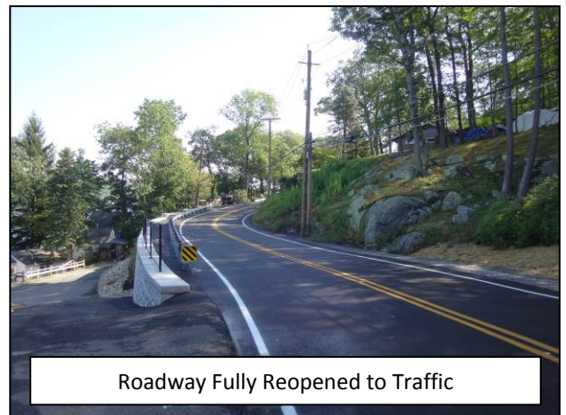
Roadway Fully Reopened to Traffic