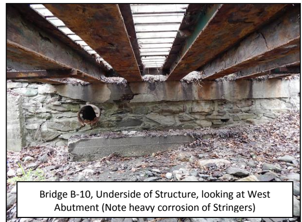
Bridge B-10, Underside of Structure, looking at West Abutment (Note heavy corrosion of Stringers)