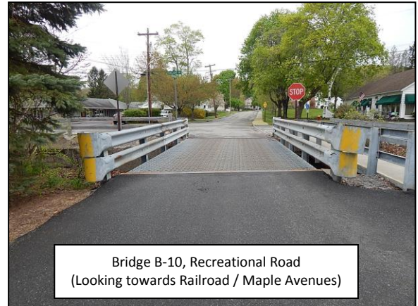
Bridge B-10, Recreational Road (Looking towards Railroad / Maple Avenues)