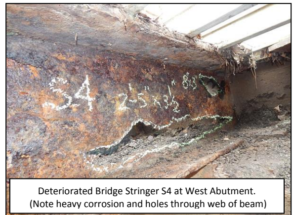
Deteriorated Bridge Stringer S4 at West Abutment. (Note heavy corrosion and holes through web of beam)