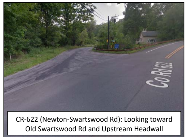
CR-622 (Newton-Swartswood Rd): Looking toward Old Swartswood Rd and Upstream Headwall