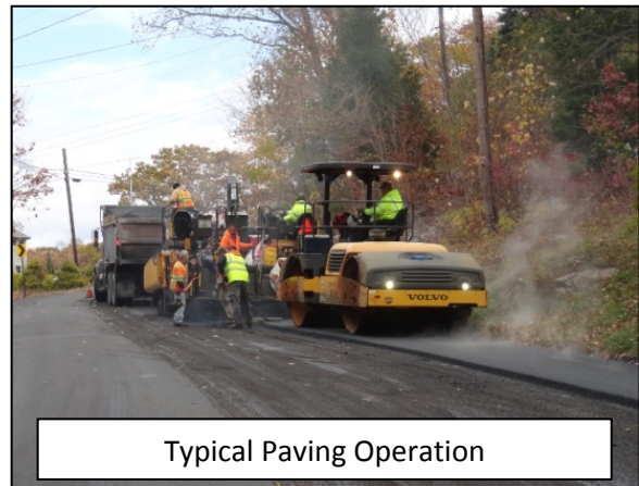
Typical Paving Operation