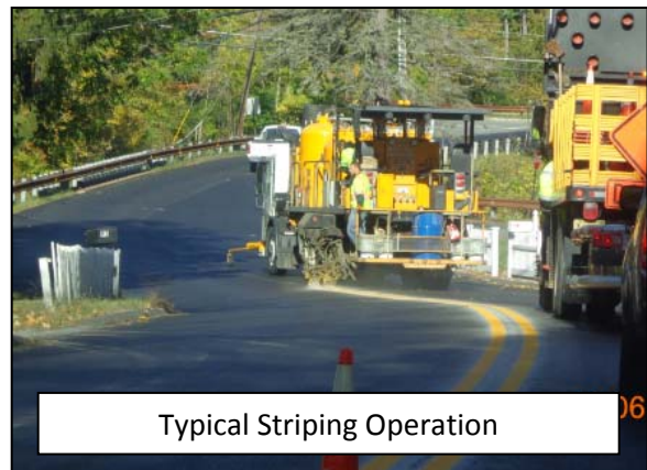
Typical Striping Operation