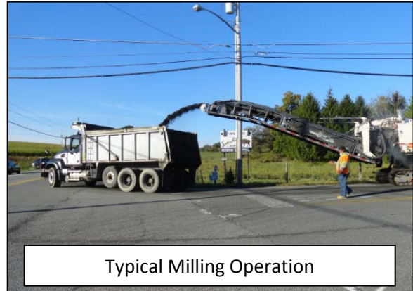
Typical Milling Operation

In response to the resolution of shutdown of all Transportation Trust Fund Projects, construction on this project shall resume/begin on or about Thursday October 20, 2016. Progression of work shall be monitored in consideration of weather conditions and availability of funding.