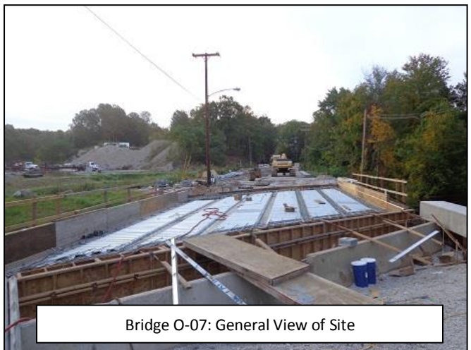
Bridge O-07: General View of Site