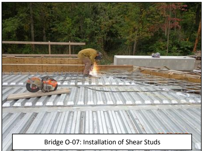
Bridge O-07: Installation of Shear Studs