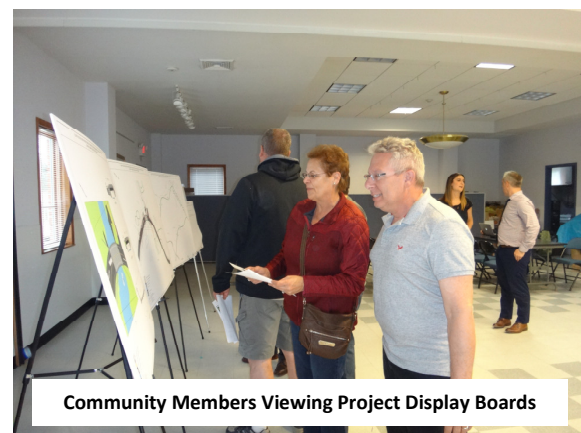
Community Members Viewing Project Display Boards