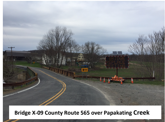
Bridge X-09 County Route 565 over Papakating Creek

Construction is anticipated to commence in mid to late June 2018 under a full road closure and reopen to traffic in December 2018.