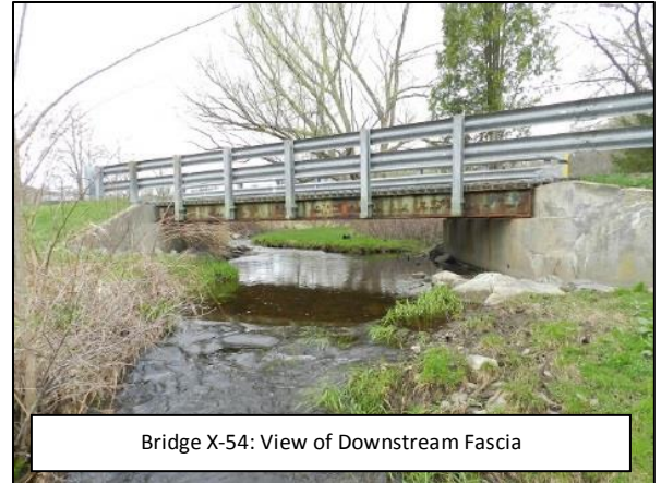
Bridge X-54: View of Downstream Fascia