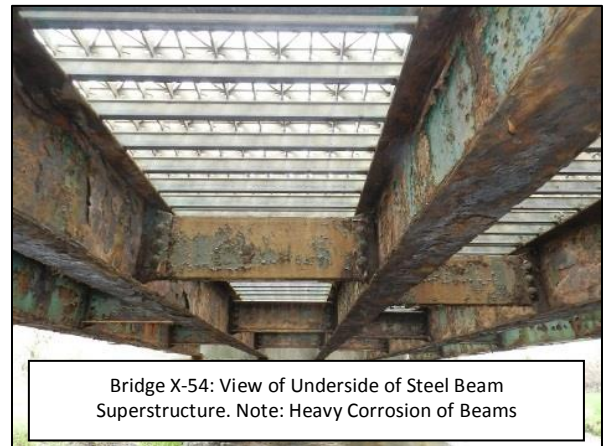
Bridge X-54: View of Underside of Steel Beam Superstructure. Note: Heavy Corrosion of Beams