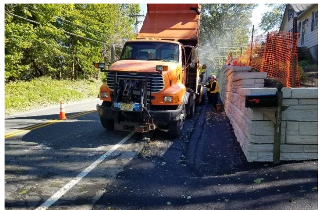
CR 620 Wall: View of Reconstructed Wall Looking East