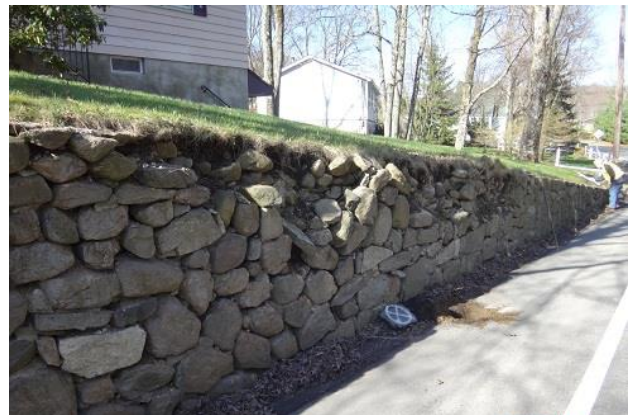
CR 620 Wall: View of Original Wall Looking South

For more information about this project please feel free to contact Josh Roe, Engineer Trainee, of the Sussex County Division of Engineering at 973-579-0430 or dpw@sussex.nj.us