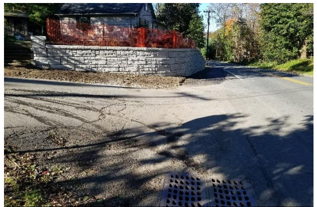
CR 620 Wall: View of Reconstructed Wall Looking West