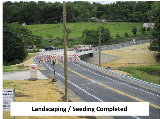
Landscaping / Seeding Completed