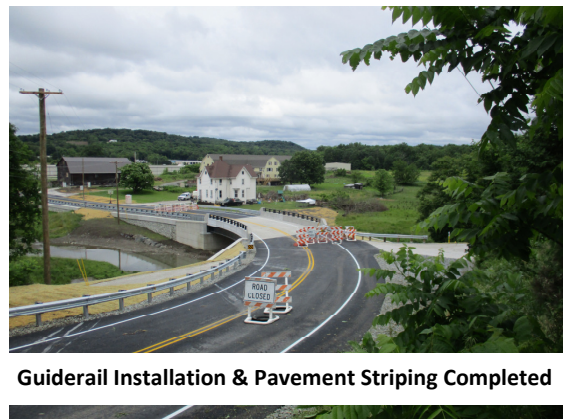
Guiderail Installation & Pavement Striping Completed