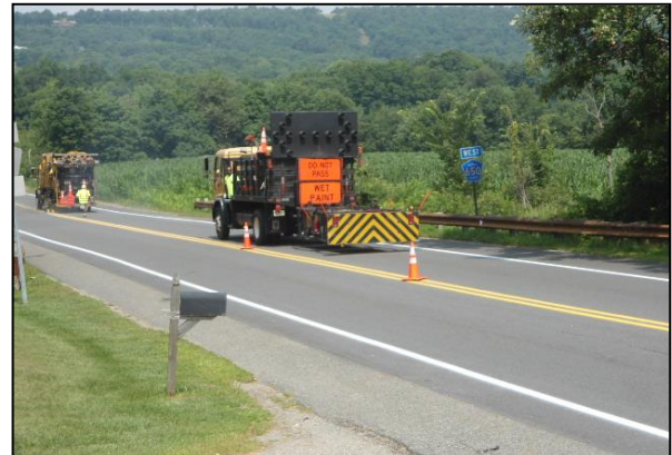
Typical Striping Operation