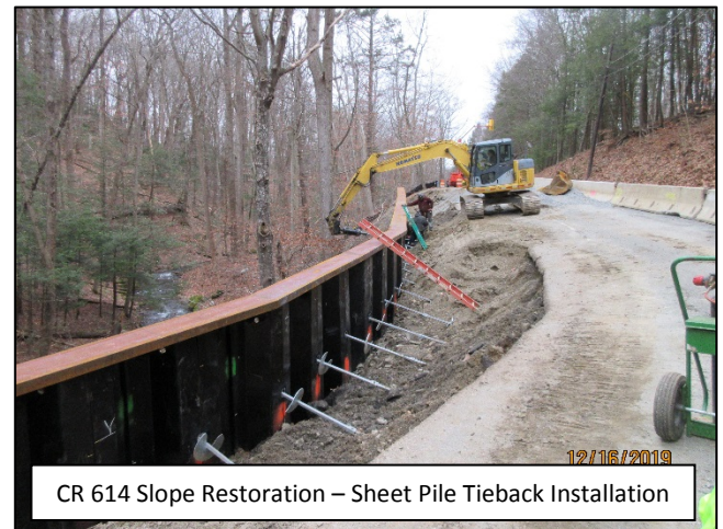
CR 614 Slope Restoration – Sheet Pile Tieback Installation