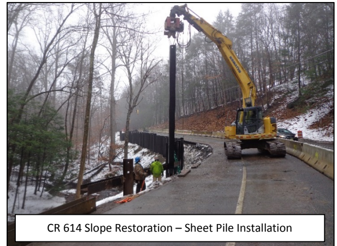
CR 614 Slope Restoration – Sheet Pile Installation