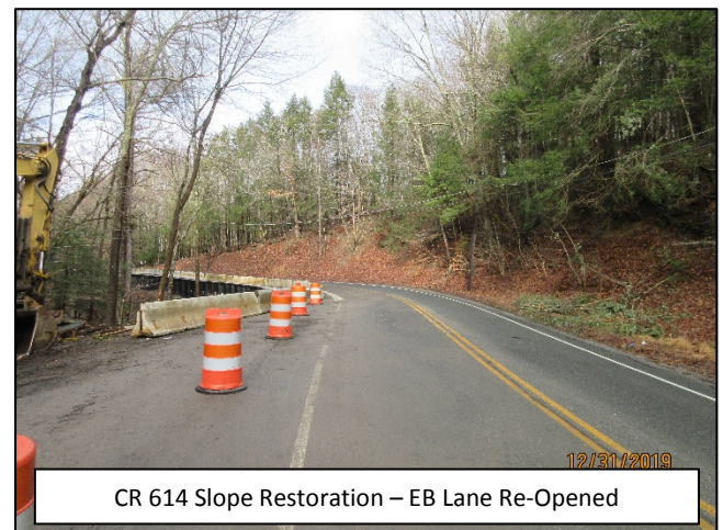
CR 614 Slope Restoration – EB Lane Re-Opened