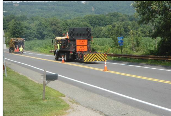
Typical Striping Operation