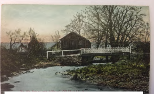
Historic Postcard of Bridge X-48 Circa 1911