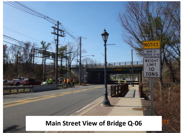
Main Street View of Bridge Q-06

The test pitting operation will require a full closure of Main Street at Bridge Q-06, with a signed detour. Pedestrian access will be maintained through use of sidewalk/ pedestrian bridge on east side of Main Street.