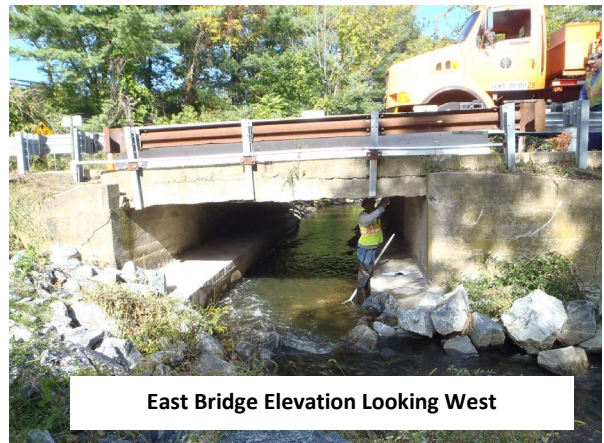
East Bridge Elevation Looking West