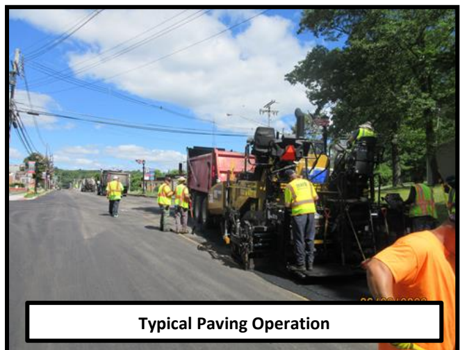
Typical Paving Operation