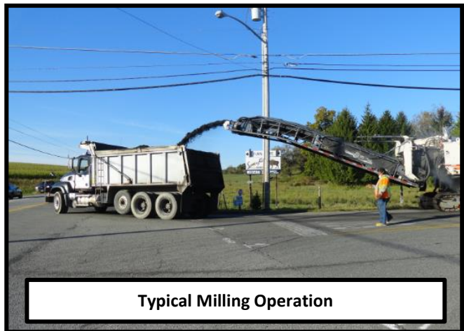
Typical Milling Operation