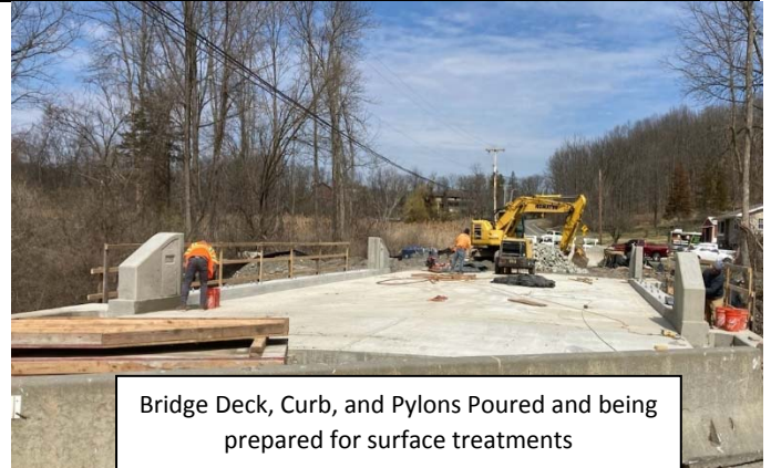
Bridge Deck, Curb, and Pylons Poured and being prepared for surface treatments