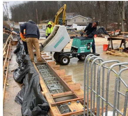
Pouring Concrete Bridge Curb