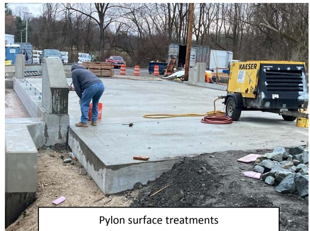
Pylon surface treatments