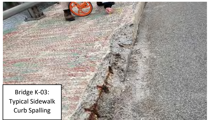
Bridge K-03: Typical Sidewalk Curb Spalling