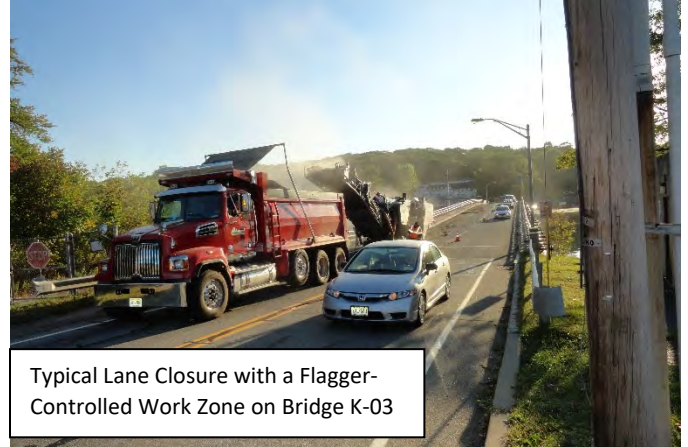
Typical Lane Closure with a Flagger-Controlled Work Zone on Bridge K-03

For more information regarding this project, please contact the Sussex County Division of Engineering at 973-579-0430