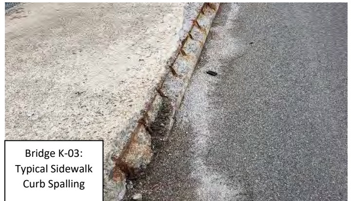
Bridge K-03: Typical Sidewalk Curb Spalling