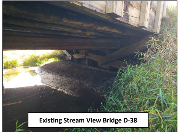
Existing Stream View Bridge D-38

A road closure and signed detour will be in place for the duration of construction, which is anticipated to last through the end of 2024. Access to driveways and municipal roads will be maintained throughout construction.