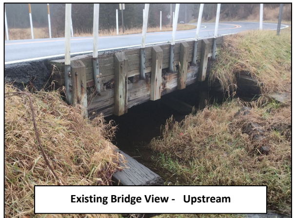
Existing Bridge View - Upstream