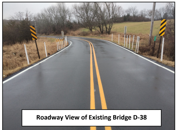
Roadway View of Existing Bridge D-38