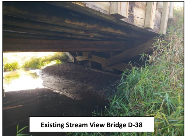
Existing Stream View Bridge D-38

A road closure and signed detour will be in place for the duration of construction, which is anticipated to last through the end of 2024. Access to driveways and municipal roads will be maintained throughout construction.