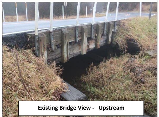
Existing Bridge View - Upstream