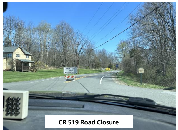
CR 519 Road Closure