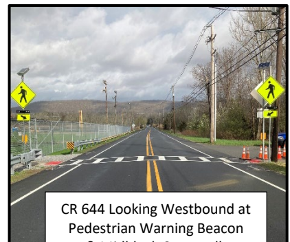
CR 644 Looking Westbound at Pedestrian Warning Beacon & Midblock Crosswalk