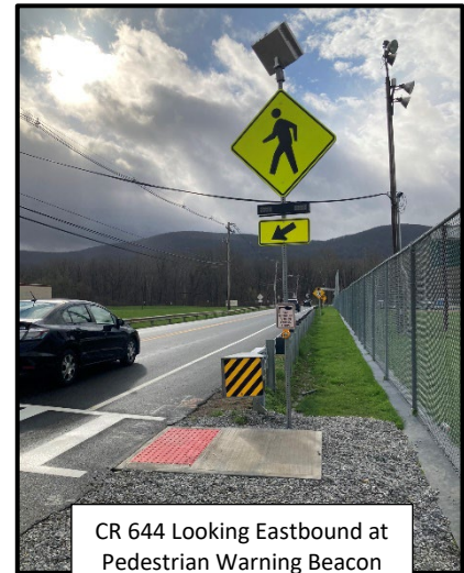
CR 644 Looking Eastbound at Pedestrian Warning Beacon