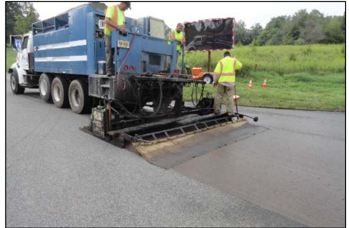
Micro Surfacing on CR 626