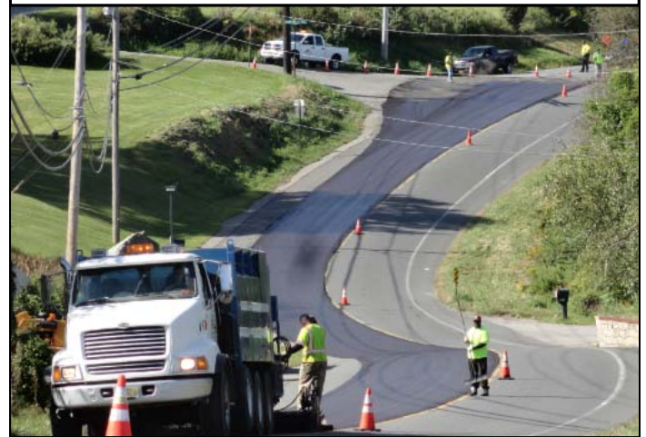
Micro Surfacing on CR 565