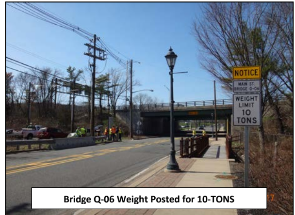
Bridge Q-06 Weight Posted for 10-TONS