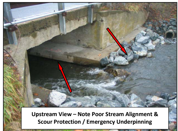
Upstream View – Note Poor Stream Alignment & Scour Protection / Emergency Underpinning