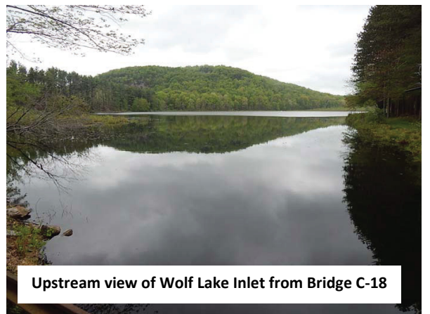
Upstream view of Wolf Lake Inlet from Bridge C-18