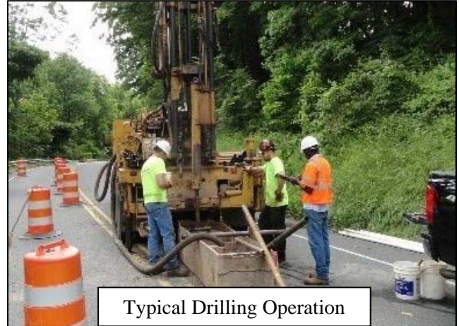
Typical Drilling Operation