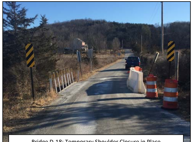
Bridge D-18: Temporary Shoulder Closure in Place