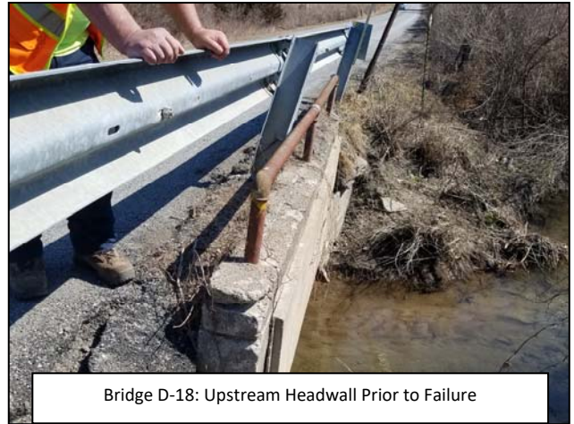
Bridge D-18: Upstream Headwall Prior to Failure