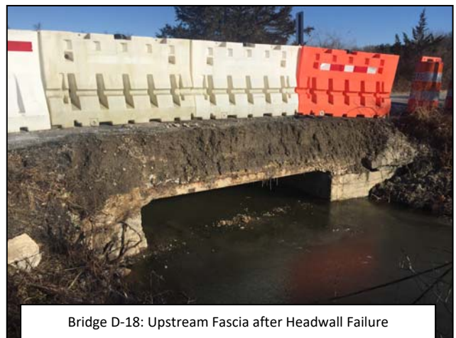
Bridge D-18: Upstream Fascia after Headwall Failure