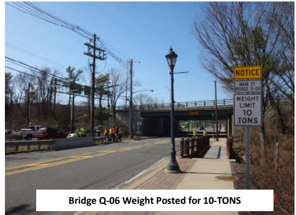
Bridge Q-06 Weight Posted for 10-TONS

Bridge Q-06 is an 18-foot long single span concrete encased steel girder bridge founded on concrete-faced masonry abutments situated on Main Street over the Wallkill River in Sparta Township. The bridge, estimated to have been constructed in 1935, is structurally deficient and in overall poor condition due to the superstructure. The bridge carries a 10-TON weight limit posting.