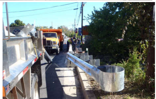
Interim Maintenance Measures Performed by County Crew

Dates are preliminary and subject to change due to unforeseen circumstances