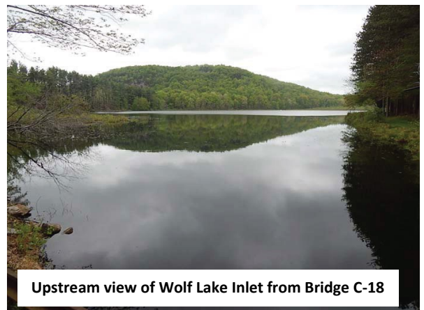
Upstream view of Wolf Lake Inlet from Bridge C-18