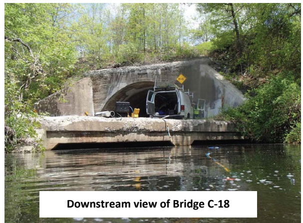
Downstream view of Bridge C-18