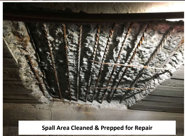
Spall Area Cleaned & Prepped for Repair