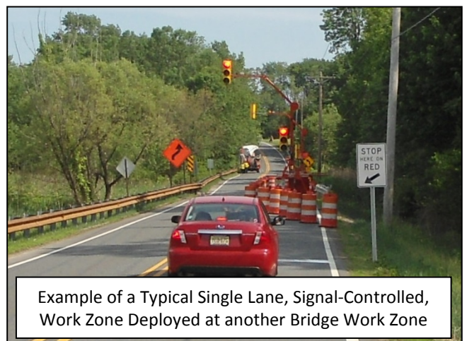
Example of a Typical Single Lane, Signal-Controlled, Work Zone Deployed at another Bridge Work Zone