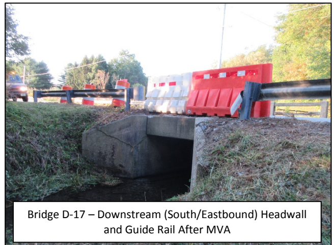
Bridge D-17 – Downstream (South/Eastbound) Headwall and Guide Rail After MVA