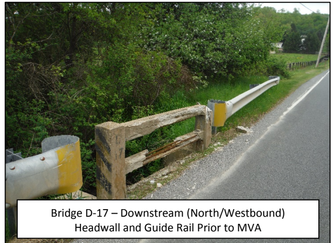
Bridge D-17 – Downstream (North/Westbound) Headwall and Guide Rail Prior to MVA