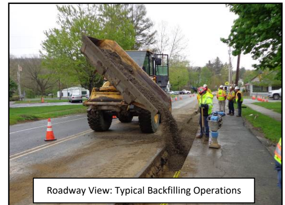
Roadway View: Typical Backfilling Operations