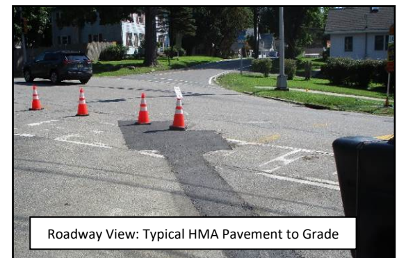
Roadway View: Typical HMA Pavement to Grade