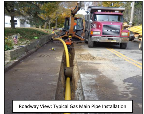
Roadway View: Typical Gas Main Pipe Installation