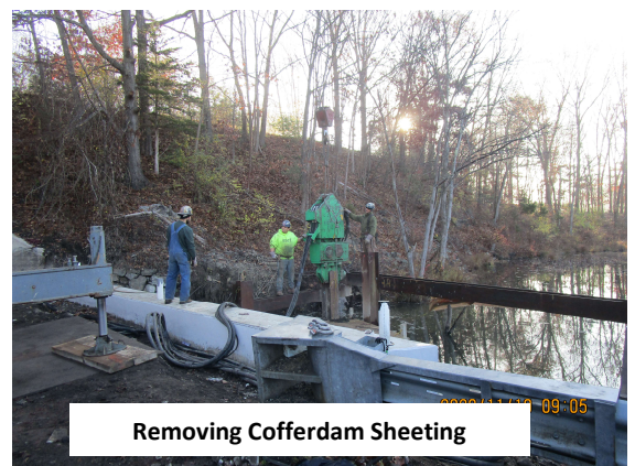
Removing Cofferdam Sheeting