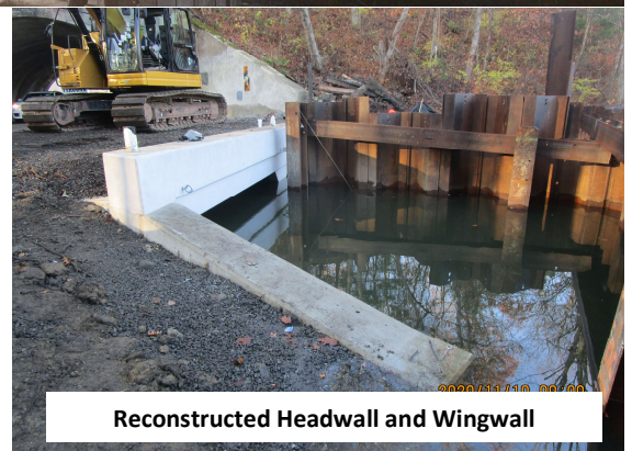
Reconstructed Headwall and Wingwall